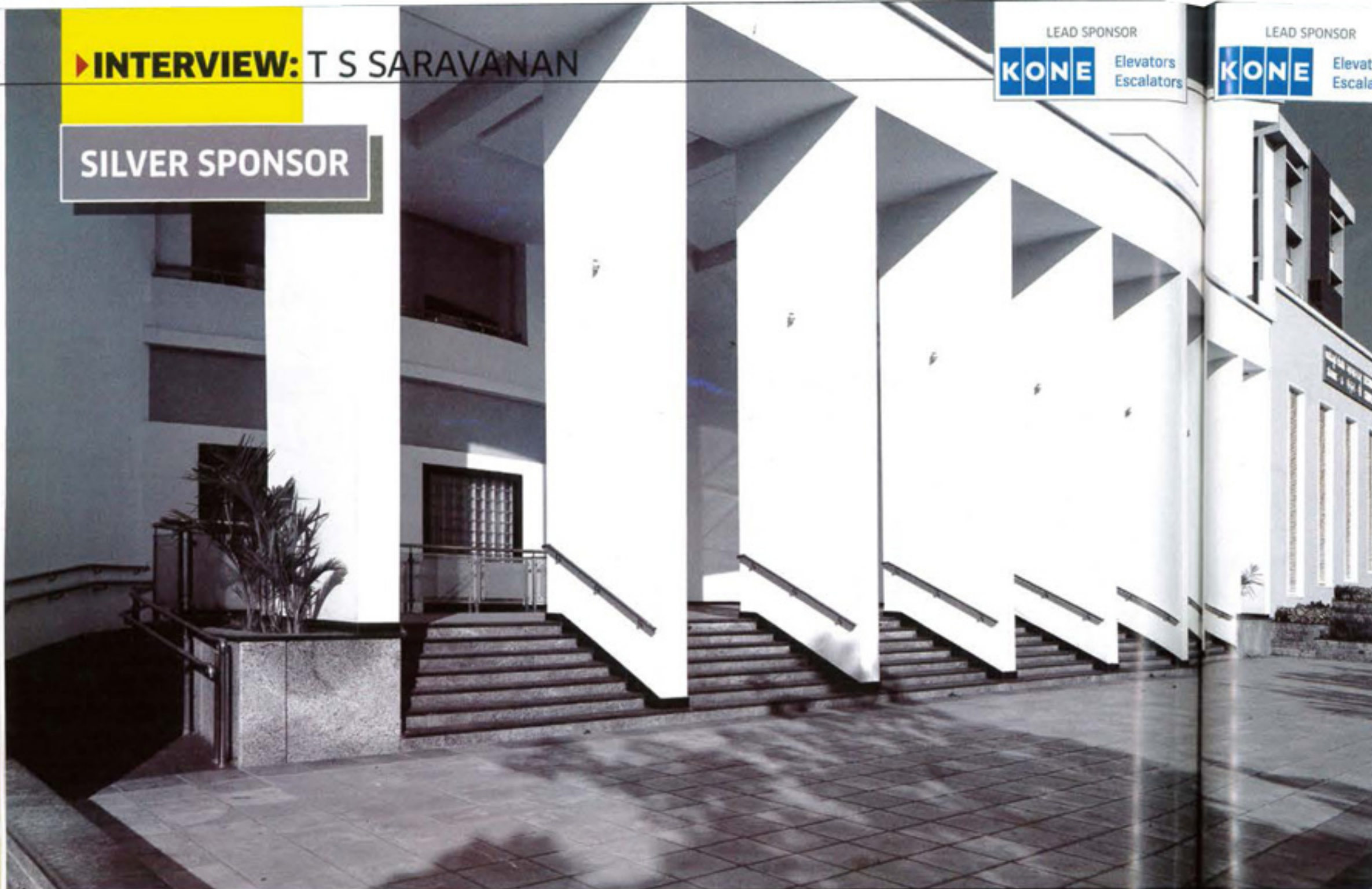
ENTRANCE - WESTERN SIDE TEACHING BLOCK