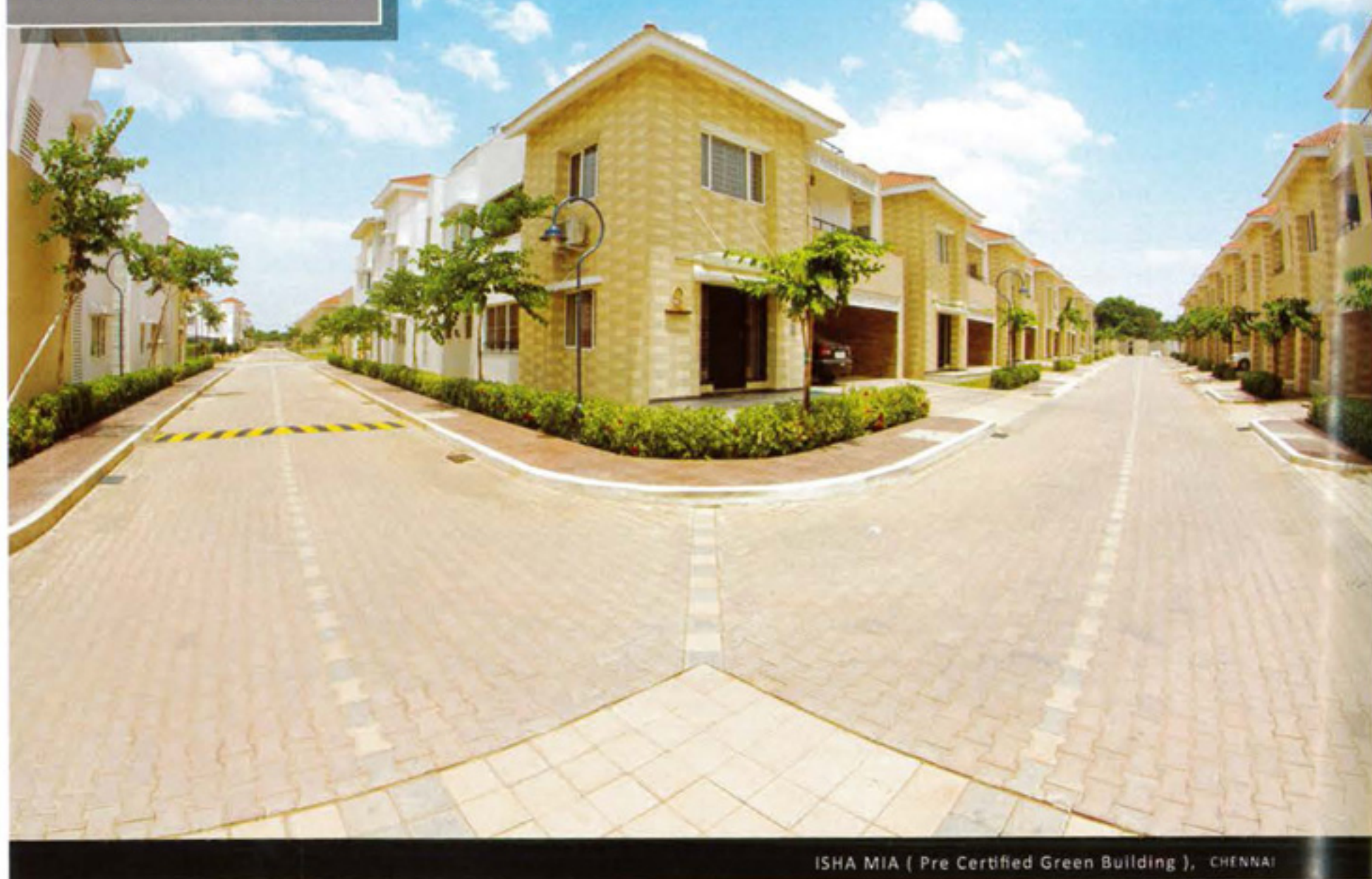
ISHA MIA ( Pre Certified Green Building ), CHENNAI

for education institutions, IT parks, industrial establishments, corporate houses, condominiums among others.