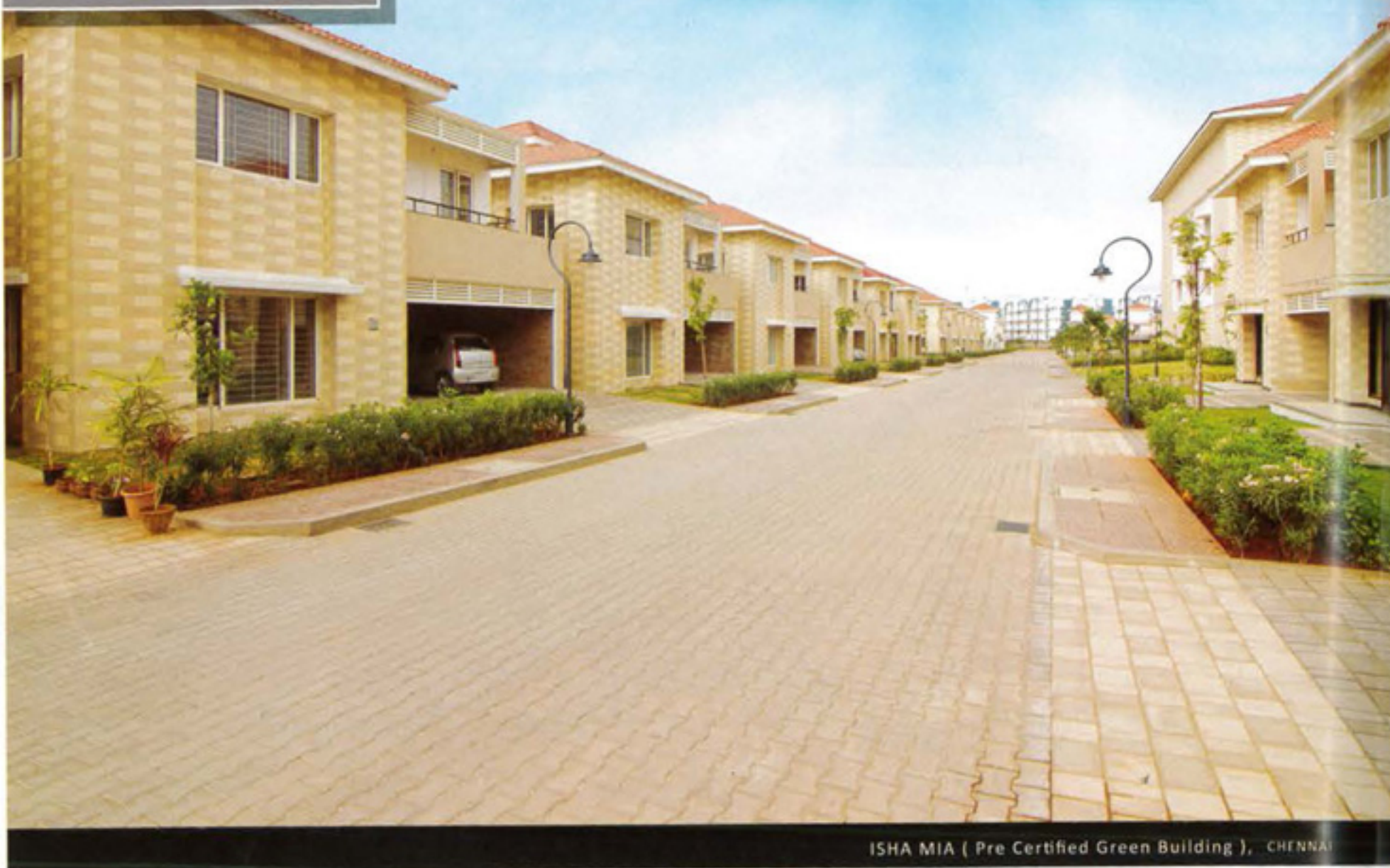
ISHA MIA ( Pre Certified Green Building ), CHENNAI

to set up business outside of my home town. The fundamentals of my vision in architecture is to bring to our society, various aspects of modern architecture from the rest of the world - with a strong undertone of blending the social connect with the locality to create perfect harmony.