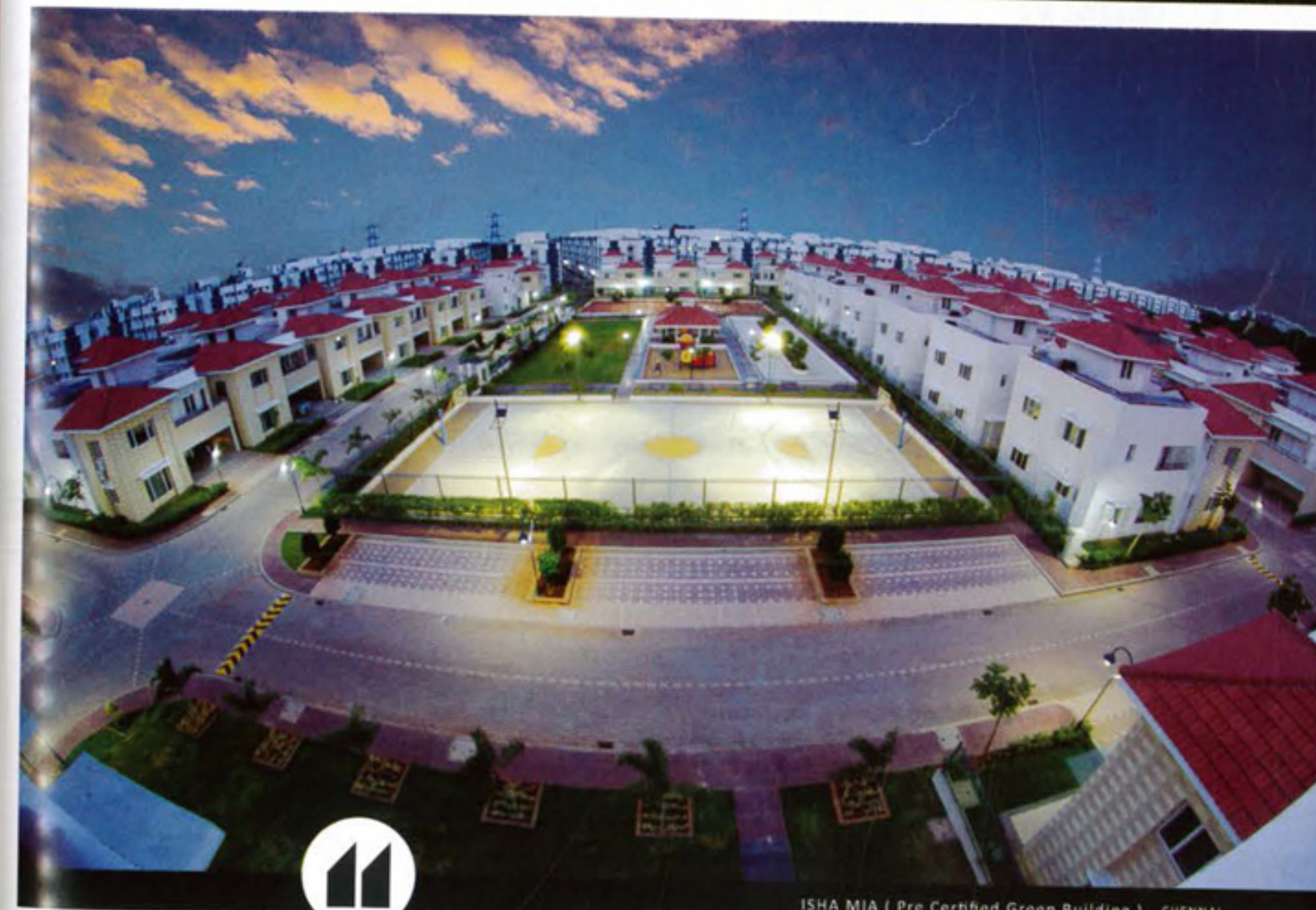
ISHA MIA ( Pre Certified Green Building ), CHENNAI